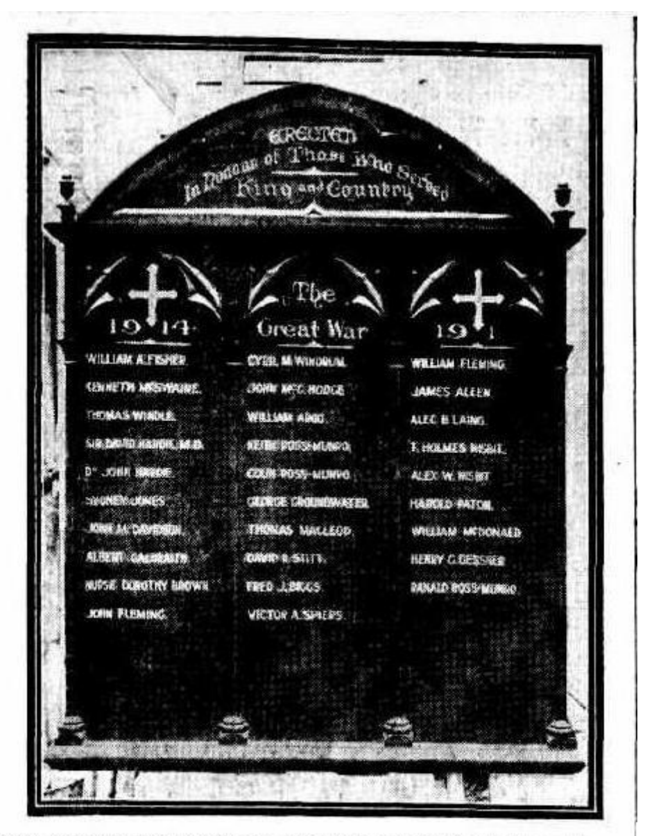
THE HONOUR BOARD OF ST. PAUL'S PRESBYTERIAN CHURCH, BRISBANE.